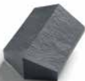
Victorian hip end cap ERS 1329GY2-FG