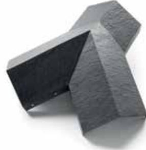
Edwardian 3-way ridge top cap ERS 1322GY2 (25°) Also available in: 15° (ERS 1330GY2) 20° (ERS 1331GY2) 30° (ERS 1332GY2) 35° (ERS 1333GY2)