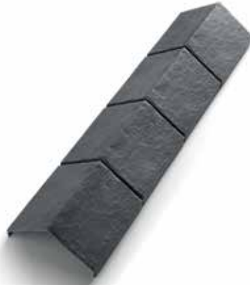
Ridge/hip length cap (6m) ERS 1321GY2-FG