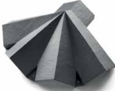
Victorian 5-way ridge top cap ERS 1326GY2 (25°) Also available in: 15° (ERS 1334GY2) 20° (ERS 1335GY2) 30° (ERS 1336GY2) 35° (ERS 1337GY2)