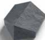
Edwardian hip end cap ERS 1325GY2-FG